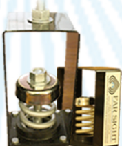
Model - FS - H 5 Spring Hangers Vibration Isolator Ceiling Mounted units