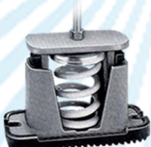
Model - FS - Z Housed/Restrained Superior Spring Isolators Floor Mounted