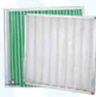
SYNTHETIC/PRE AIR FILTERS