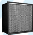
HEPA/ULPA AIR FILTERS MEDIA: USA