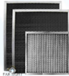
CARBON & ALUMINUM/MESH AIR FILTERS