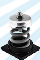
Model - FS Free Standing Spring Isolator Floor Mounted