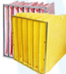
BAG/POCKET AIR FILTERS